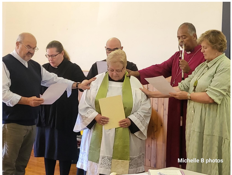
Michelle B photos