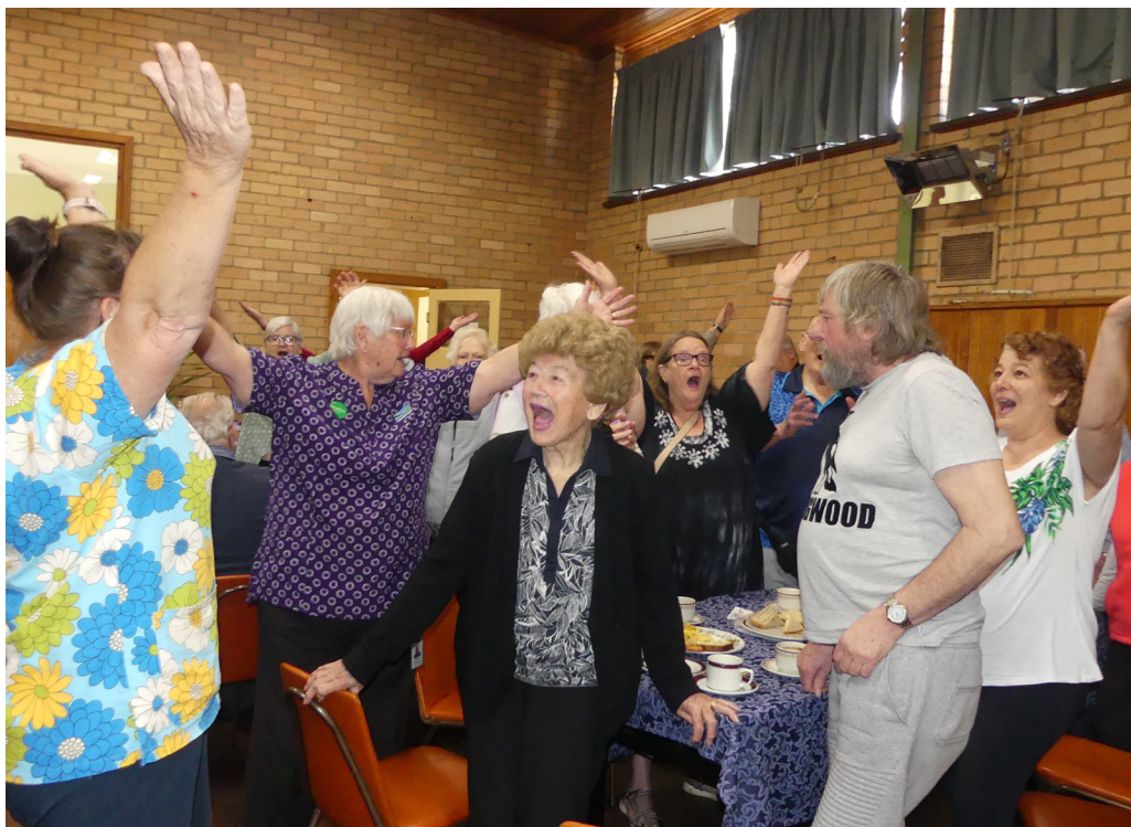
Some of the Seymour Hospital group doing the Y.M.C.A song antics at the Parish of Central Goulburn Mothers' Union Morning Melodies

The annual fundraiser was a success thanks to the support of all concerned and the funds raised will go off to the MU national project.