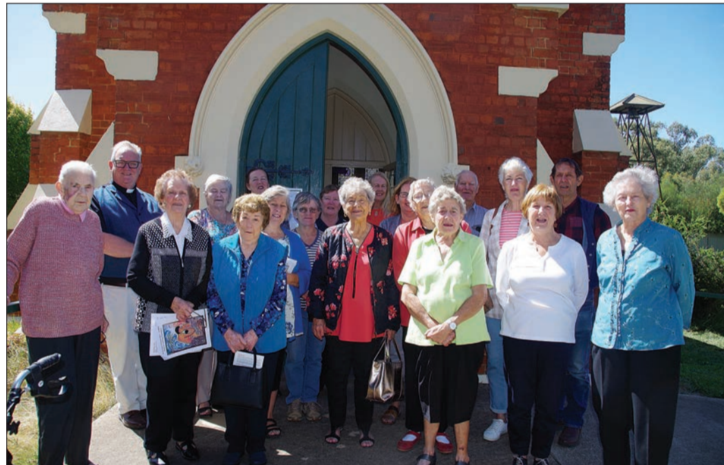
PHOTO ABOVE: International World Day of Prayer group that gathered at St John's Anglican Church for the 2021 service on Friday, March 5.

There was a great opportunity for prayer at each of the churches in the parish reflection around why pilgrimage was important and lots of opportunities for conversation and enjoying each other's company. This is something that we will do again as a part of Lent in the coming years.