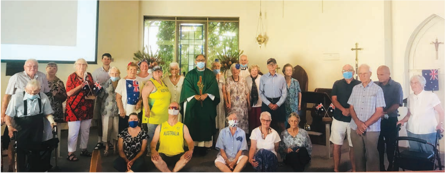
St. Margaret's Cobram celebrated Australia day in colour and style, notwithstanding the covid19 restrictions