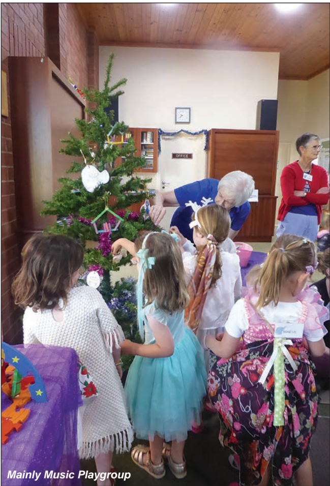
Mainly Music Playgroup

The next service was a Sung Eucharist at St. Thomas's at St. James at 9 pm Christmas Eve and on Christmas Day at 9am a Sung Eucharist Service at St. Cuthbert's.