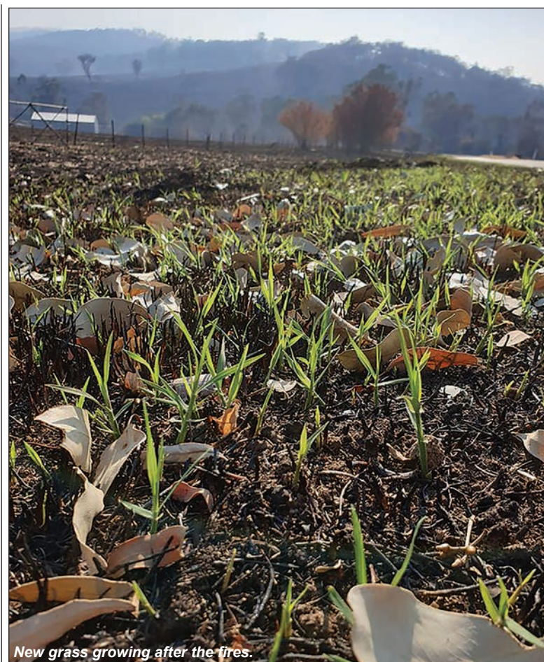
New grass growing after the fires.